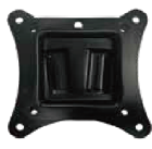
Vesa Mount (Optional)